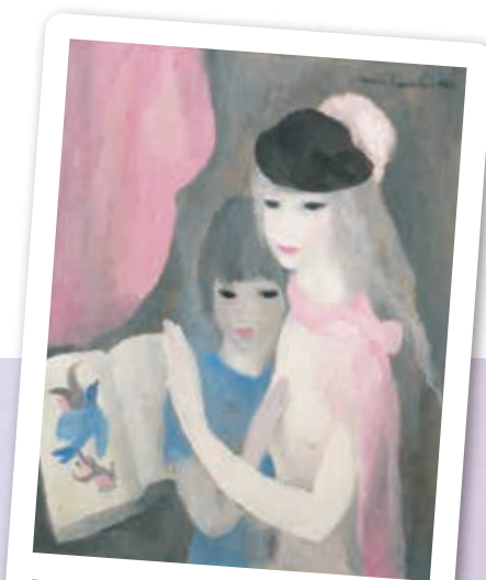
EXHIBITION PASSPORT 2024