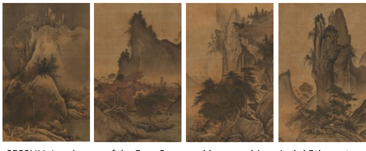
SESSHU, Landscape of the Four Seasons , Muromachi period, 15th century, Artizon Museum, Ishibashi Foundation