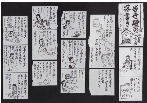
YAMAGUCHI Akira, Scribblings on the Contemporary Wall, Olympics and Paralympics (detail), 2021, Collection of the artist, Photo by MIYAJIMA Kei ©YAMAGUCHI Akira, Courtesy of Mizuma Art Gallery