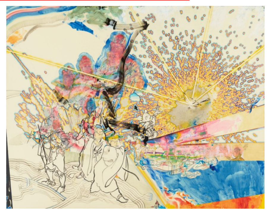
YAMAGUCHI Akira, Raigo , 2015, Collection of the artist, Photo by Nissha F8, Inc. ASAI Kensuke, ©YAMAGUCHI Akira, Courtesy of Mizuma Art Gallery

The captions for the works on display have been changed.