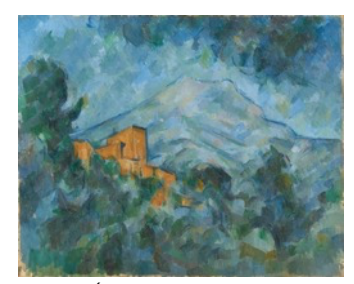
Paul CÉZANNE, Mont Sainte-Victoire and Château Noir , c. 1904-06 Artizon Museum, Ishibashi Foundation