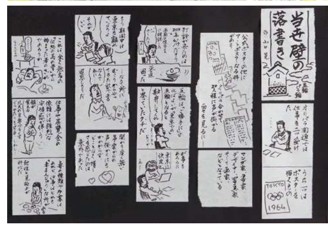
YAMAGUCHI Akira, Graffiti Today (detail), 2021, Collection of the artist ©YAMAGUCHI Akira, Courtesy of Mizuma Art Gallery