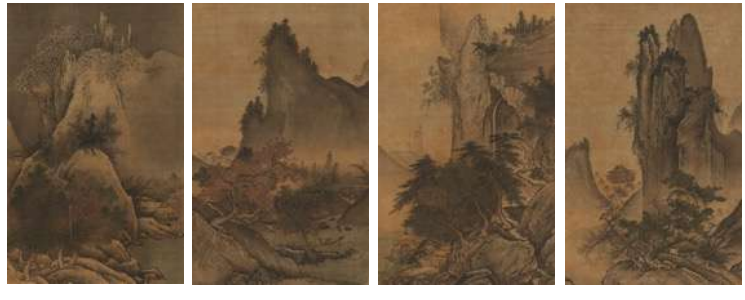
SESSHU, Landscape of the Four Seasons , Muromachi period, 15th century, Artizon Museum, Ishibashi Foundation