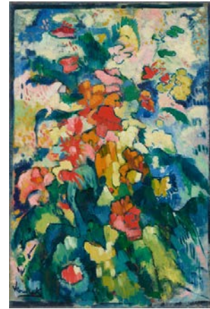
Maurice de VLAMINCK, Symphony in Colours (Flowers) , c. 1905-06, Artizon Museum, Ishibashi Foundation [Recent Acquisitions] ★ © ADAGP, Paris & JASPAR, Tokyo, 2023 C4125