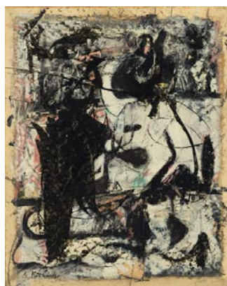
Willem DE KOONING, January , 1947-48, Artizon Museum, Ishibashi Foundation [Recent Acquisitions] ★ © 2023 The Willem de Kooning Foundation, New York/ ARS, New York/ JASPAR, Tokyo C4125