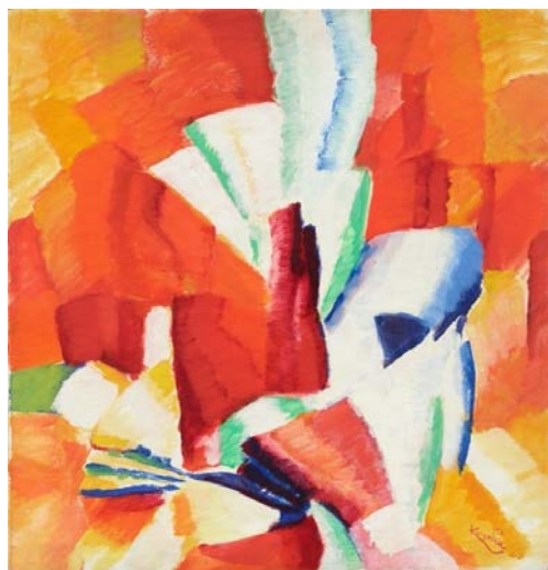
František KUPKA, Study on Red Ground , c. 1919, Artizon Museum, Ishibashi Foundation [Recent acquisitions]

*The composition of the exhibition and the captions for the works on display have been changed