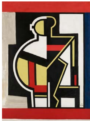
Fernand LÉGER, Abstract Composition , 1919, Artizon Museum, Ishibashi Foundation