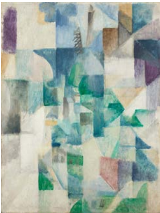
Robert DELAUNAY, Windows on the City , 1912, Artizon Museum, Ishibashi Foundation [Recent Acquisitions]