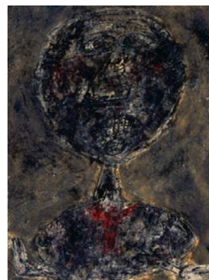
Jean DUBUFFET, Pierre Matisse a Dark Portrait , 1947, Centre Pompidou, Paris Musée national d'art moderne - Centre de création industrielle ★ © ADAGP, Paris & JASPAR, Tokyo 2023 C4125