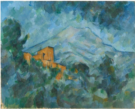
Paul CÉZANNE, Mont Sainte-Victoire and Château Noir , c.1904-06, Artizon Museum, Ishibashi Foundation