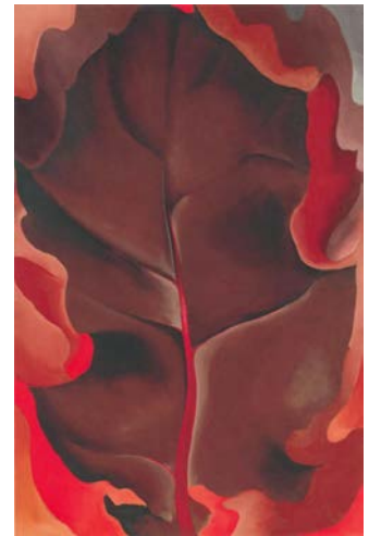
Georgia O'KEEFFE, Autumn Leaf II , 1927, Artizon Museum, Ishibashi Foundation [Recent Acquisitions] ★ © 2023 The Georgia O'Keeffe Foundation/ ARS, New York/ JASPAR, Tokyo C4125