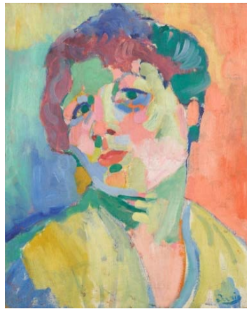
André DÉRAIN, Head of a Woman , c.1905, Artizon Museum, Ishibashi Foundation [Recent Acquisitions]