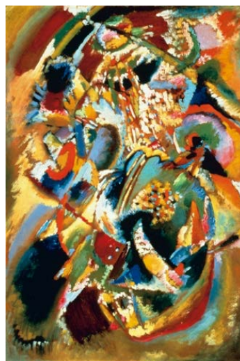
Wassily KANDINSKY, Study for Panel for Edwin R. Campbell No.4 (Carnival, Winter) , 1914, The Miyagi Museum of Art