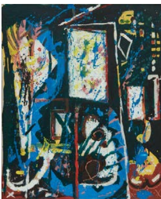
Jackson POLLOCK, Untitled (Composition with Vertical Trapezoid) , c.1943, Private Collection