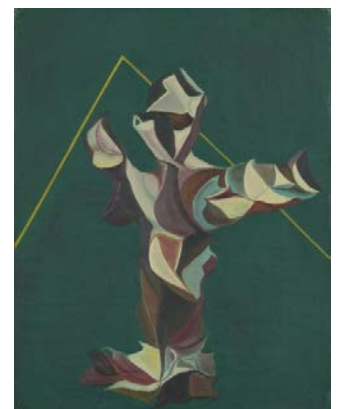
FUKUSHIMA Hideko, MP , 1950, Artizon Museum, Ishibashi Foundation (Deposited Work) © Kazuo Fukushima