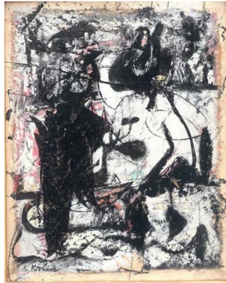
Willem DE KOONING, January, 1947-48, [New acquisition] ☆

From the late nineteenth century to the outbreak of World War I, France enjoyed its Belle Époque, a time of peace and prosperity. In a society brimming with a lively, free atmosphere that spurred artistic creativity, Fauvism, Cubism, and other new art forms bloomed in France at the beginning of the century. In time, those developments led to the birth of abstract painting, one of the outcomes of stylistic evolution in painting. Then abstraction shaped twentieth-century art world. This exhibition explores the history of abstract painting, and its ties to the future. Beginning around the time of abstract painting's birth, it presents abstraction's rise, trends flourishing, mainly in French painting before and after the war, and the rise of Hot Abstraction and Abstract Expressionism in France after the war. It also explores abstract art's simultaneous emergence in Japan, with the Jikken Kobo (Experimental Workshop), Gutai, and other movements, its multifaceted development, and its connections with the next generation.