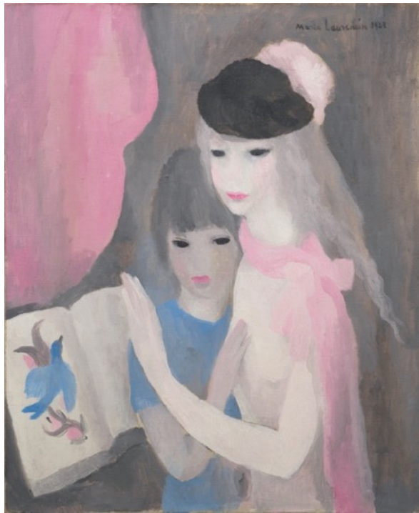
Marie LAURENCIN, Two Young Girls , 1923

December 9 [Sat.],2023 - March 3 [Sun.], 2024