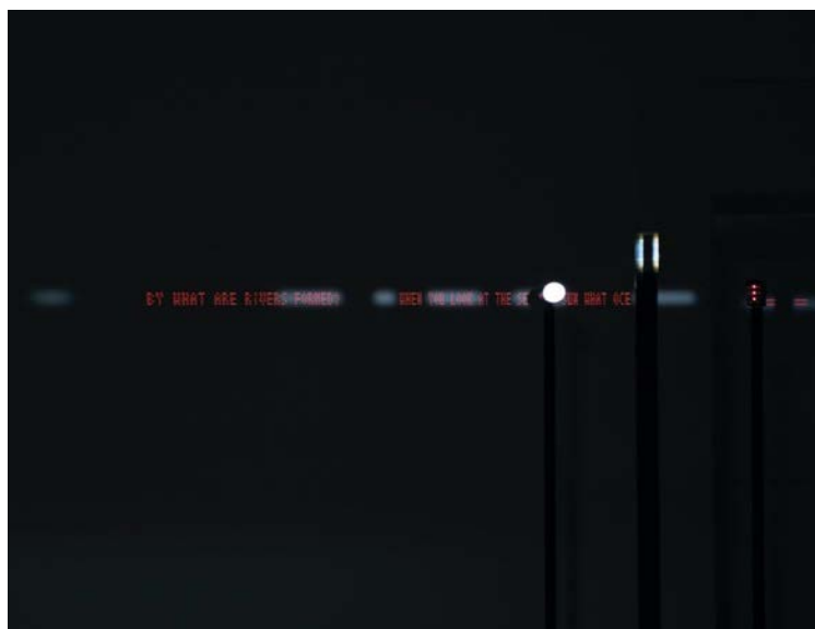
Dumb Type, 2022, Photograph by Takatani Shiro; © Dumb Type

February 25 [Sat.] - May 14 [Sun.], 2023