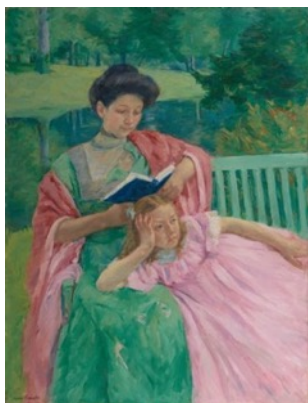
Marry CASSATT, Augusta Reading to Her Daughter , 1910

Women engaged in reading has been a theme in European art since the eighteenth century. Modern Japanese artists who studied in the West have also addressed that theme. This exhibition introduces works from the Ishibashi Foundation Collection depicting women reading, including paintings by Matisse, Cassatt, and Yamashita Shintaro.