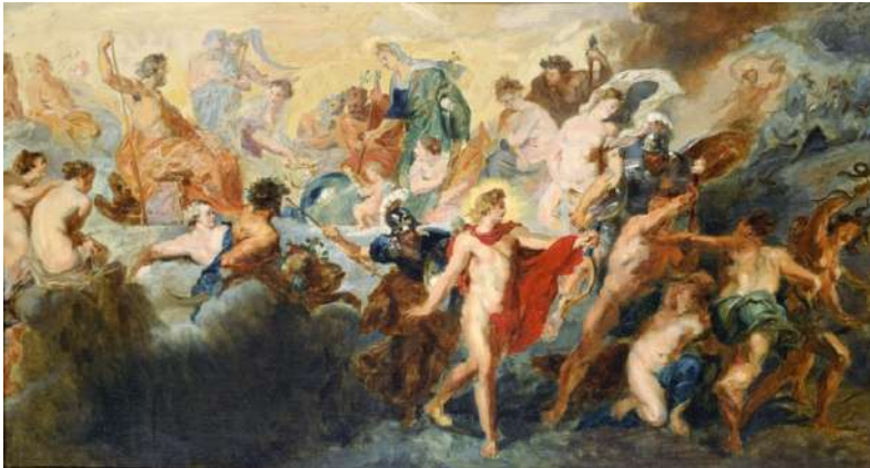
③ Pierre-Auguste RENOIR, Copy after the Painting by Rubens "The Council of Gods" , 1861, The National Museum of Western Art, Tokyo Donated by Mr. Ryuzaburo Umehara

Nineteenth-century France saw advances in research on the arts of the past as they had developed in European countries. As Albert André has reported, Renoir said, "A painter must learn in art museums." He saw value in visiting museums in many countries and engaging in conversations with the arts produced by his predecessors. This section addresses the creative work of Renoir, who addressed his search to produce paintings that would satisfy his ideals, to the end of his life.