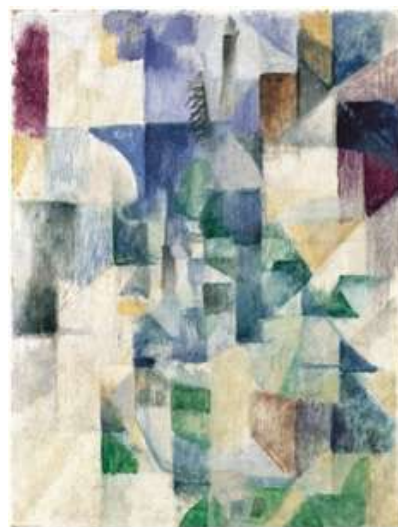
② Robert DELAUNAY, Windows on the City , 1912, Artizon Museum, Ishibashi Foundation