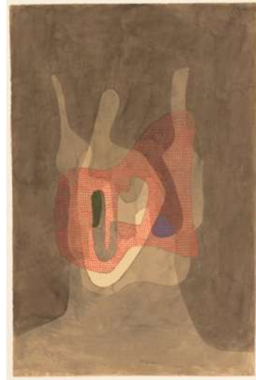
⑨ Paul KLEE, Protectress , 1932, Artizon Museum, Ishibashi Foundation