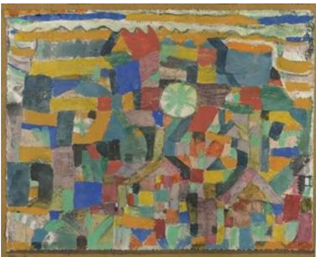
① Paul KLEE, Friendly Place , 1919, Artizon Museum, Ishibashi Foundation

In 2021, the Ishibashi Foundation added Paul Klee's Friendly Place (1919) and Robert Delaunay's Windows on the City (1912) to its collection. 1912, when Windows on the City was created, was also the year when Klee, who was based in Munich at that time, acted on his longstanding fascination with Delaunay through the introduction of the Blue Rider (der Blaue Reiter) and went to visit him in Paris. These two works, which express these two artists' relationship and its influences, are being shown for the first time in this exhibition.