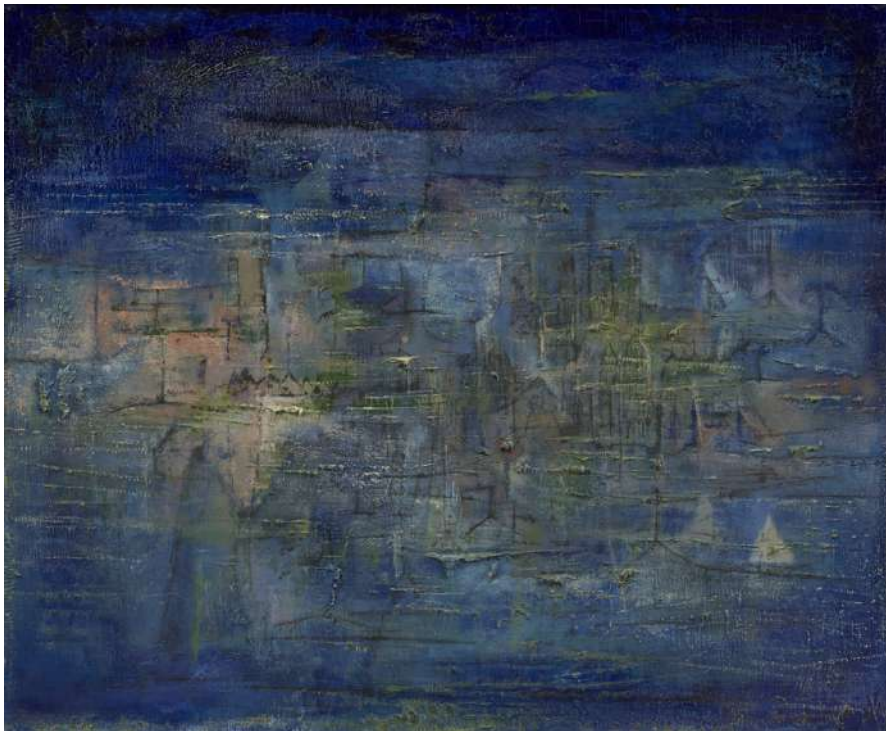
ZAO Wou-Ki, Sunken City , 1954, Artizon Museum, Ishibashi Foundation ©2022 by ProLitteris, Zurich & JASPAR, Tokyo C3760

The Artizon Museum, Ishibashi Foundation (Director: Ishibashi Hiroshi), presents Transformation: Arts Crossing Borders in the 19th and 20th Centuries .