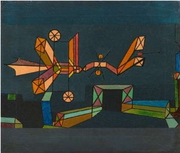
⑧ Paul KLEE, Arrival of the Aerial Dragon , 1927, Artizon Museum, Ishibashi Foundation

The Swiss-German artist Paul Klee was influenced early in his career by contemporary French art. After World War I, as a master at the Bauhaus and as a pioneer of Surrealism, his image as an artist changed repeatedly. That diversity reflects the transfigurations of art-related connections between wartime Germany and France and also between Europe and America.