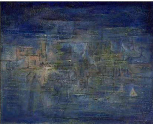
⑩ ZAO Wou-Ki, Sunken City, 1954, Artizon Museum, Ishibashi Foundation C3760

The painter Zao Wou-Ki, who was from China, moved to Paris immediately after World War II. After establishing his own style under Paul Klee's influence, he changed his creative vocabulary through contact with a variety of contemporary trends, including abstract paintings in France and American Abstract Expressionism. He is a prime example of an artist whose work transcends national borders, beyond East and West.