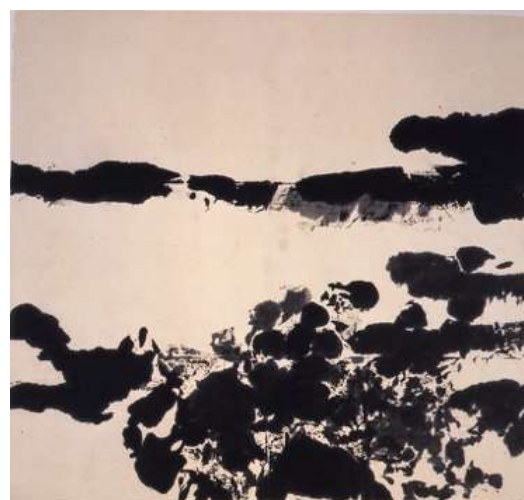
⑪ ZAO Wou-Ki, Untitled , 1980, Artizon Museum, Ishibashi Foundation ©2022 by ProLitteris, Zurich & JASPAR, Tokyo C3760