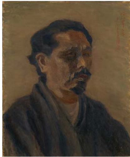
SAKAMOTO Hanjiro, Self-Portrait , 1929

Aoki Shigeru and Sakamoto Hanjiro sought their own styles amidst the period when Western-style painting was beginning to mature in Japan. Aoki attracted public attention from his youth, and his masterpiece, A Gift of the Sea (1904) has been positioned as an exemplar of Meiji Romanticism. Despite his stellar debut, he spent his last years wandering about Kyushu; his short life ended without his being able to return the central art world. Sakamoto was invited to Tokyo by Aoki and debuted there a few later years later than his friend; he later studied abroad. During his long life—Sakamoto lived to the age of 87—he applied himself steadily to his work, addressing many subjects, including horses, still lifes, and the moon and building a tranquil world view. Aoki and Sakamoto worked in different styles and had different personalities, but they encouraged each other in their work. This exhibition introduces both artists' oeuvre and points at which their lives intersected.