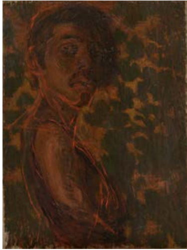
AOKI Shigeru, Self-Portrait , 1903

July 30 [Sat.] - October 16 [Sun.], 2022