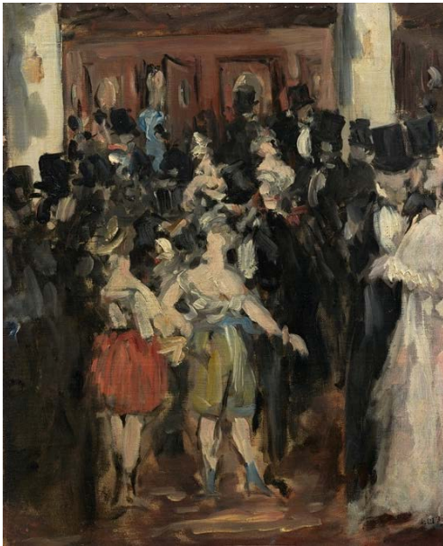
Édouard MANET, Masked Ball at the Opera , 1873

November 5 [Sat.], 2022 – February 5 [Sun.], 2023