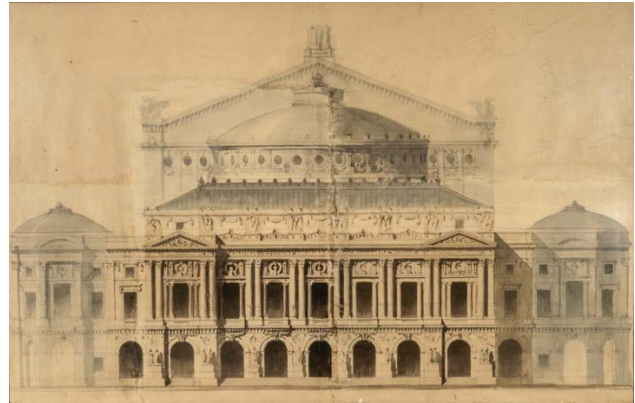
Charles GARNIER, Front view of the Facade of the Palais Garnier , Plan Garnier O3, BnF, Music Department, BMO

The Paris Opera House is known as a glorious sacred space for ballet and opera performances. This exhibition explores the history of the Paris Opera House from the seventeenth century to the present, examining the relationships between various fields of art and their appeal from a total art perspective. The focus is particularly on the nineteenth and early twentieth centuries, the age of romantic ballet, grand opera, and the Ballets Russes. Introducing the multifaceted appeal of the Paris Opera House from artistic, cultural, and sociological perspectives, using works from the Bibliothèque nationale de France and other sources in Japan and abroad, this exhibition reveals its historic significance. In making the many connections between the opera house and the various arts, this exhibition is an utterly unprecedented venture.