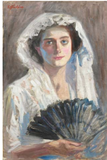
FUJISHIMA Takeji, Black Fan , 1908-09, Important Cultural Property

Two years have passed since the launch of the Artizon Museum in 2020, and this year, we celebrate the seventieth anniversary of the founding of our predecessor, the Bridgestone Museum of Art. The Ishibashi Foundation collection began as the personal collection of our founder, Ishibashi Shojiro and was later donated to the foundation, which continues to broaden and deepen it. This exhibition presents the trajectory of the 70 years of the Artizon Museum since 1952, when the Bridgestone Museum of Art opened, through approximately 170 works of art and documentation, including ancient art, Western and modern Japanese art, Abstractionism, contemporary art, and Japanese and East Asian antique art. We also reflect on our history through posters for past exhibitions, records of the Saturday Lectures, which have been held since the museum opened, an art film series, Shojiro's journals of his travels in the West, and other archive materials.