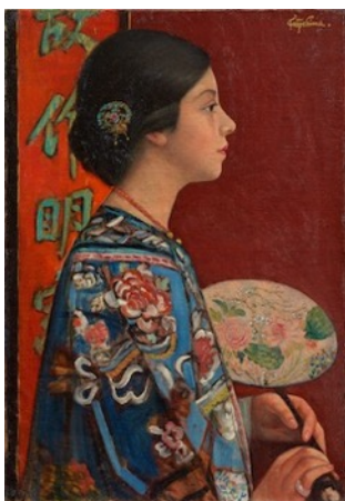
③ Fujishima Takeji, Orientalism , 1924