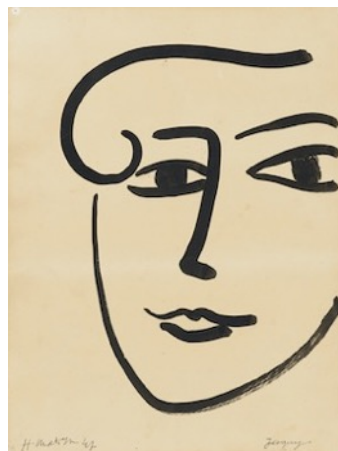
④ Henri Matisse, Jacquy , 1947