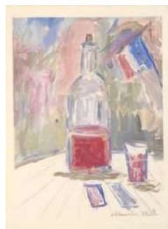
Maurice UTRILLO, Book I: Illustration for "Wine, Flowers and Flames" (Text by Georges Duhamel, et. al.) Book II: Illustration for "Across our Vineyards" (Text by René Héron de Villefosse) 1952, Artizon Museum, Ishibashi Foundation

22 September [Wed], 2021 - 10 January [Mon], 2022