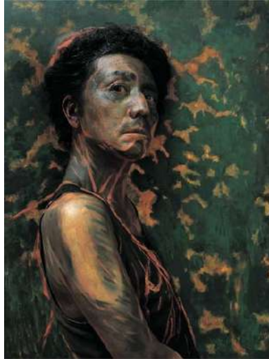
MORIMURA Yasumasa, Self Portrait in My Youth (Aoki' s Self Portrait/Youth) , 2016, collection of the artist

2 October [Sat], 2021 - 10 January [Mon], 2022