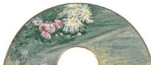
Édouard Manet, Chrysanthemums , c.1881, The Museum of Modern Art, Ibaraki

The Rimpa school of painting was initiated by Tawaraya Sotatsu in the early seventeenth century. It evolved through the work of Ogata Korin in the early eighteenth century and Sotatsu's and Korin's colleagues in context of the townsman culture of Kyoto, then Japan's imperial capital. In the early nineteenth century, Rimpa was carried on by artists such as Sakai Hoitsu and Suzuki Kiitsu, in Edo (today's Tokyo), the shogun's headquarters. In Edo, the evolving Rimpa school became an urban genre with a decorative aesthetic at its core.