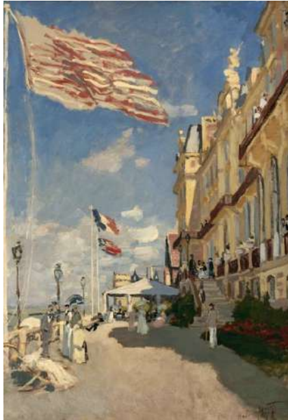
Claude MONET, Hôtel des Roches Noires, Trouville, 1870, Musée d'Orsay