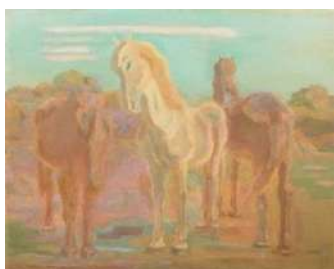
SAKAMOTO Hanjiro, Three Grazing Horses , 1932, Oil on canvas, Artizon Museum, Ishibashi Foundation

3 November [Tue], 2020 - 24 January [Sun], 2021