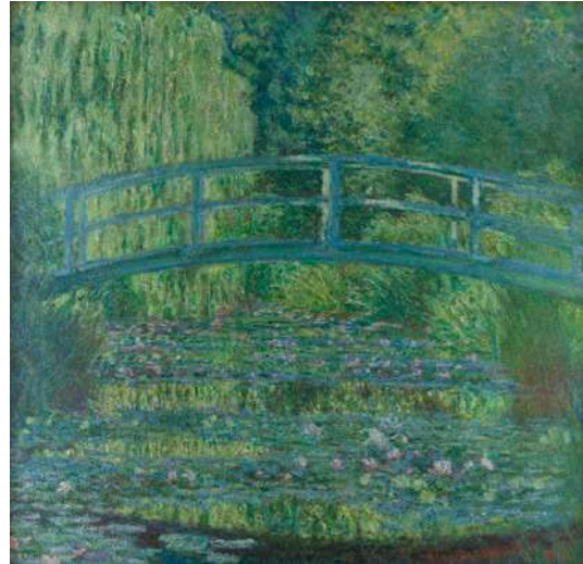
Claude MONET, Water-Lily Pond, Symphony in Green, 1899, Musée d'Orsay