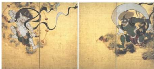
Tawaraya Sotatsu, Wind God and Thunder God , Edo period, 17th century, Kenninji Temple, National Treasure (On exhibit from 22 December [Tue], 2020 to 24 January [Sun], 2021)

*Works on display will be changed during the exhibition period. Please check our website.