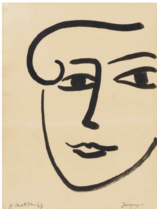
Henri MATISSE, Jacquy , 1947, Artizon Museum, Ishibashi Foundation

Steps Ahead introduces the Artizon Museum's recent acquisitions to the collection. In recent years, the Ishibashi Foundation has worked to develop its core collection of Impressionist and modern Japanese paintings more fully while expanding the collection's breadth to include works from the early twentieth century, especially Abstract paintings, contemporary art and early modern Japanese art. Since opening, we have been gradually introducing our new acquisitions, but others remain yet to be displayed: works by the Cubists, drawings by Henri Matisse, Box in a valise by Marcel Duchamp, women Abstract Expressionists, Takiguchi Shūzō and Experimental Workshop, contemporary Australian paintings, portrait photographs of artists, and much more. This exhibition of about 250 works, including 120 new acquisitions, provides a view of the Artizon Museum's continuing progress.