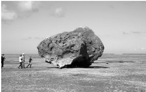
④Motoyuki Shitamichi, "Tsunami Boulder" (2015-)