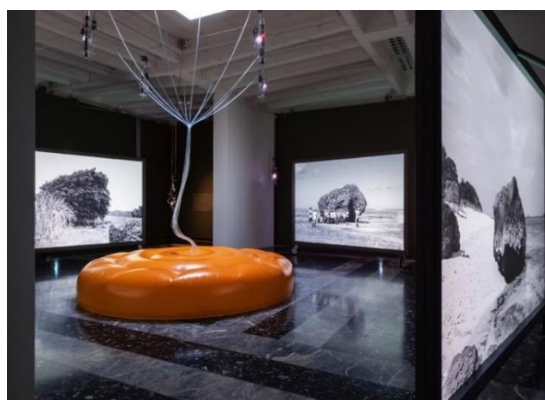
①Exhibition view, Japan Pavilion (for media use)

“Cosmo Eggs”, first exhibited in the Japan Pavilion at the 58th Venice Biennale International Art Exhibition in 2019, is a collaboration between four specialists from diverse fields – an artist, a composer, an anthropologist and an architect – curated by Hiroyuki Hattori. “Cosmo Eggs” offers a space to explore themes of coexistence and symbiosis between human and nonhuman entities. The exhibition at the Artizon is based on the original exhibition in the Japan Pavilion in Venice, adapted for the Artizon exhibition space. In addition to the original “Cosmo Eggs” show composed as a symbiosis between video, music, word and space, the Artizon exhibition will also introduce new elements such as previously not exhibited documents and an archive.